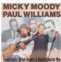
Title: SMOKESTACKS, BROOM DUSTERS & HOOCHIE COOCHIE MEN Catalogue No: ARMD00014 © 2002 Armadillo Music Ltd